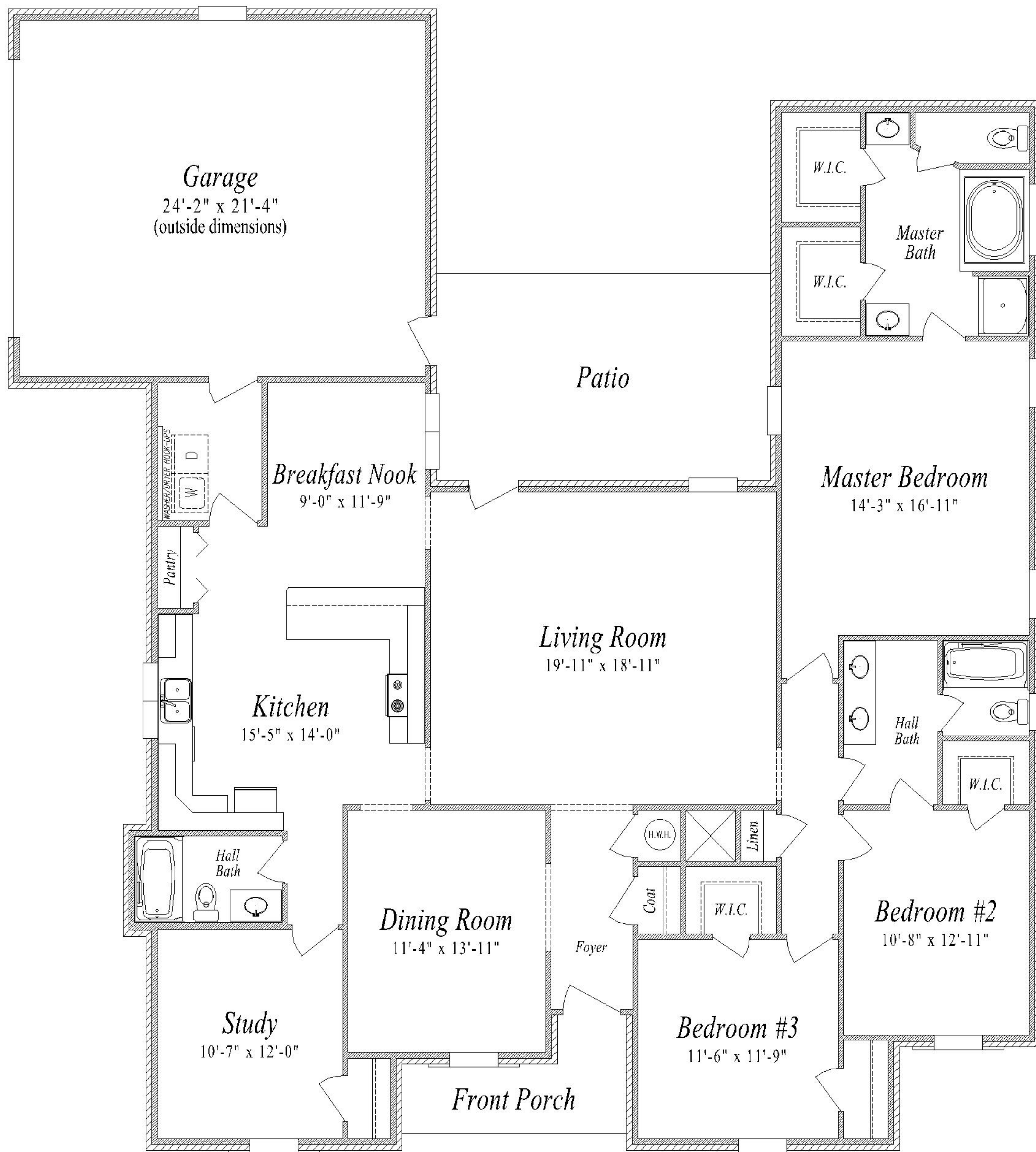
Floor Plan with Optional Brick